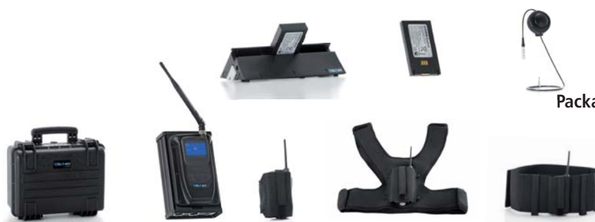
Packaging & Accessories