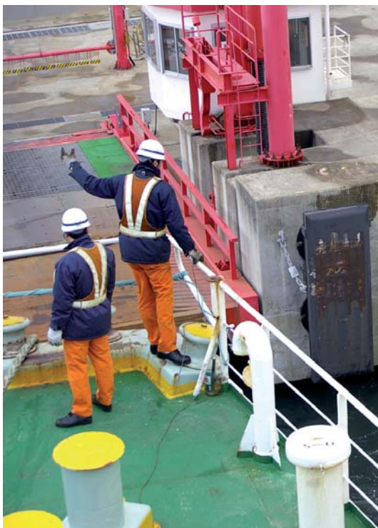
Mooring a commercial ship.